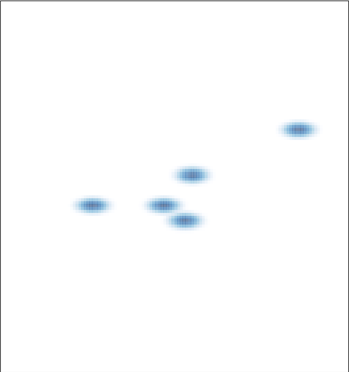
# features = 5 , max = 1